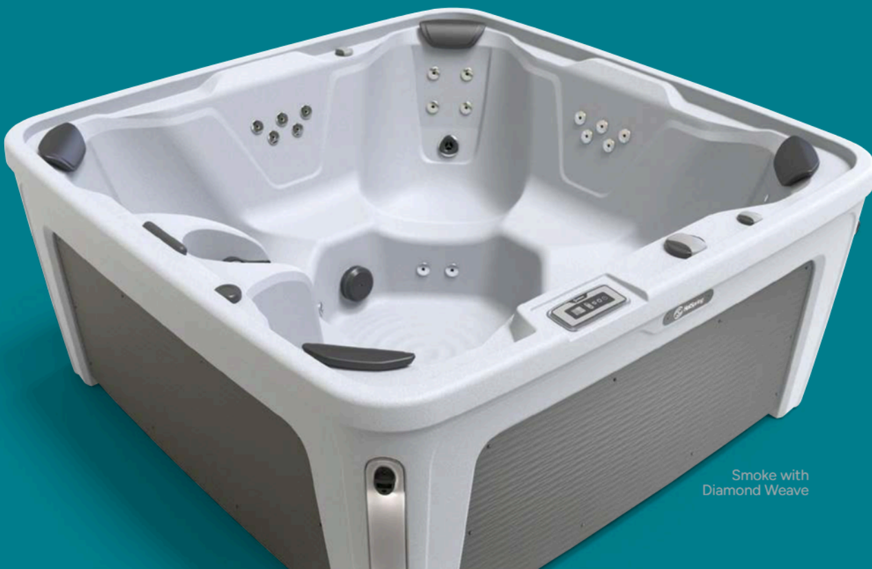
Smoke with Diamond Weave

Freeflow Collection spas come ready for the FROG® sanitizing system. Prefilled cartridges automatically release sanitizer and minerals to keep water soft, clean, and clear with less effort. Available in the U.S. only; bromine is available in Canada.