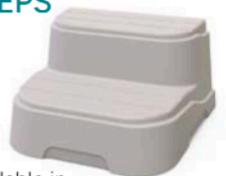
Available in Dune or Smoke