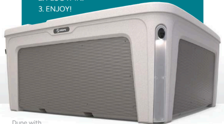
Dune with Diamond Weave